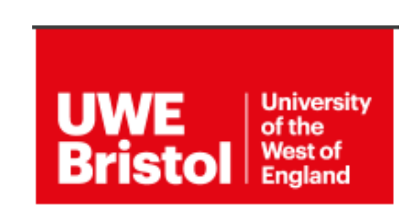
UWE Bristol England