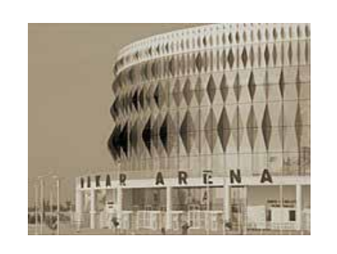
Dakar Arena Stadium Senegal