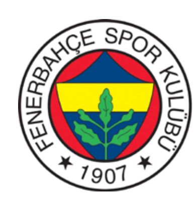
Fenerbahçe Sports Club Complex