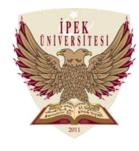
Ipek University Ankara